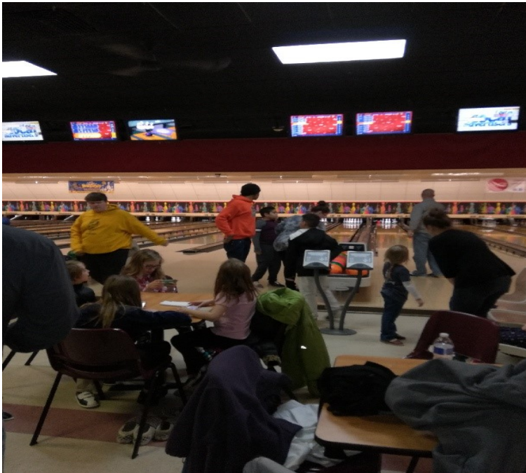
Bowling at Innans. A good time was had by all!